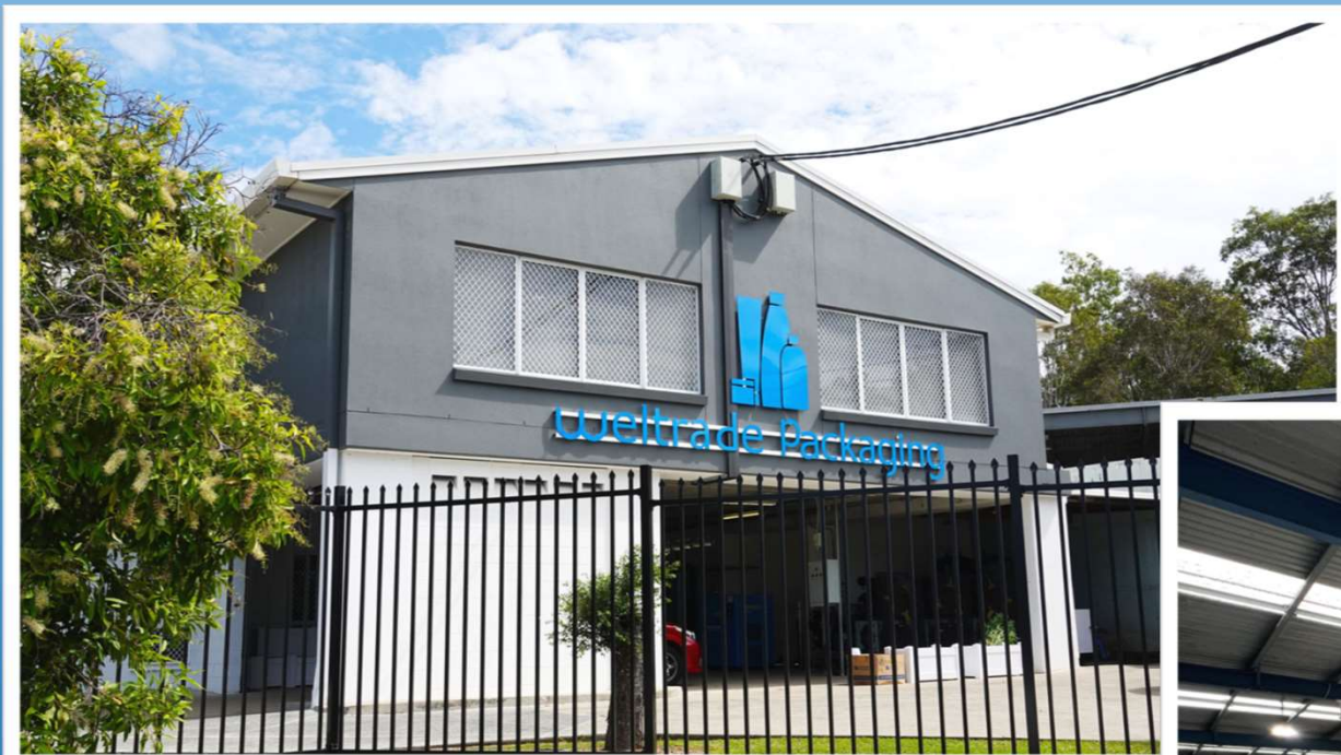
20 Barnett Place, Molendinar, QLD, 4214